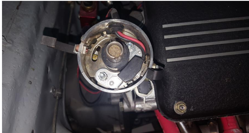
Distributor w/o cap and rotor